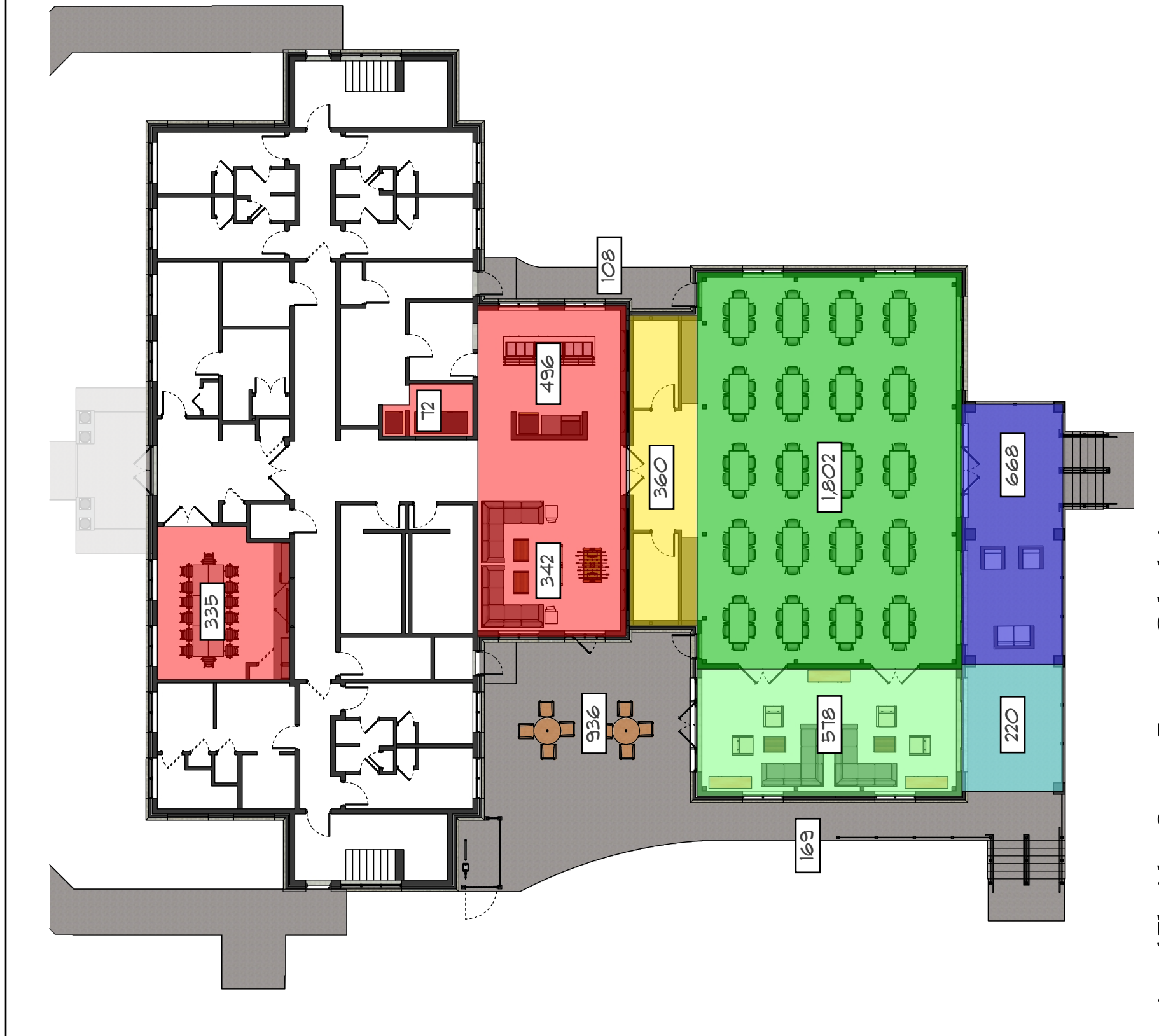
AEPi University of Florida - Square Footage Calculations