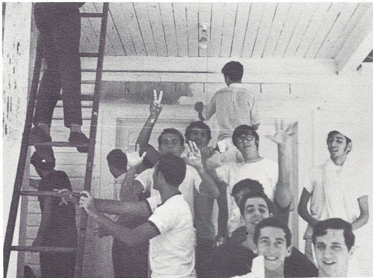
Time Out For A Peace Sign