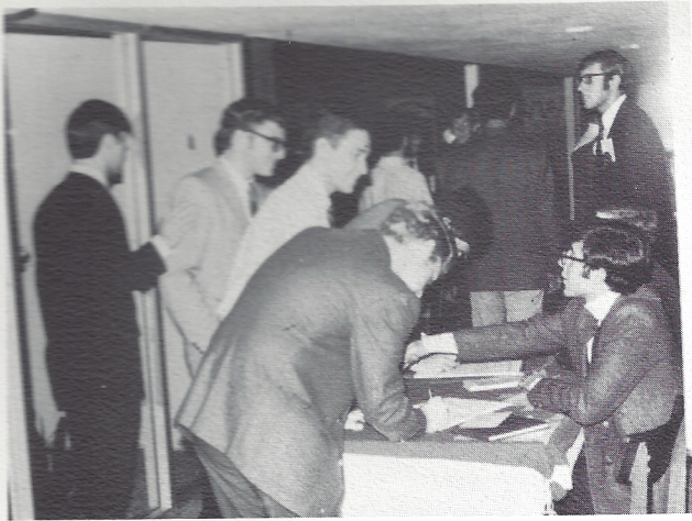
No Questions . . . just sign on the line . . . Boy!