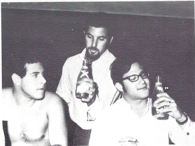
I sure would like to have one of those full bottles!