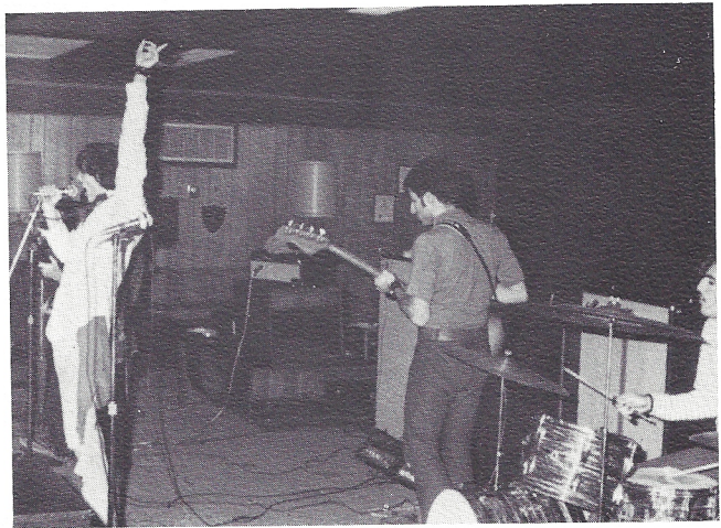
AEPi . . . one time!