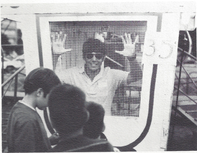
Join a fraternity, and see the world